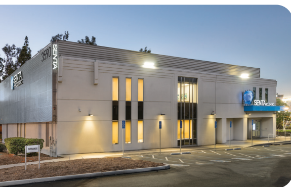
SENTA CLINIC 3590 Camino Del Rio North San Diego, CA 92108

SAN DIEGO'S LEADING DOCTORS brain, spine, head, neck & balance conditions